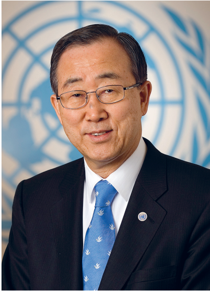
H.E. Ban Ki-moon, UN Secretary-General

“ This year we are laying the groundwork for success in 2015 on three fronts: achieving the Millennium Development Goals, adopting a meaningful new climate agreement, and establishing a new vision for a sustainable future.