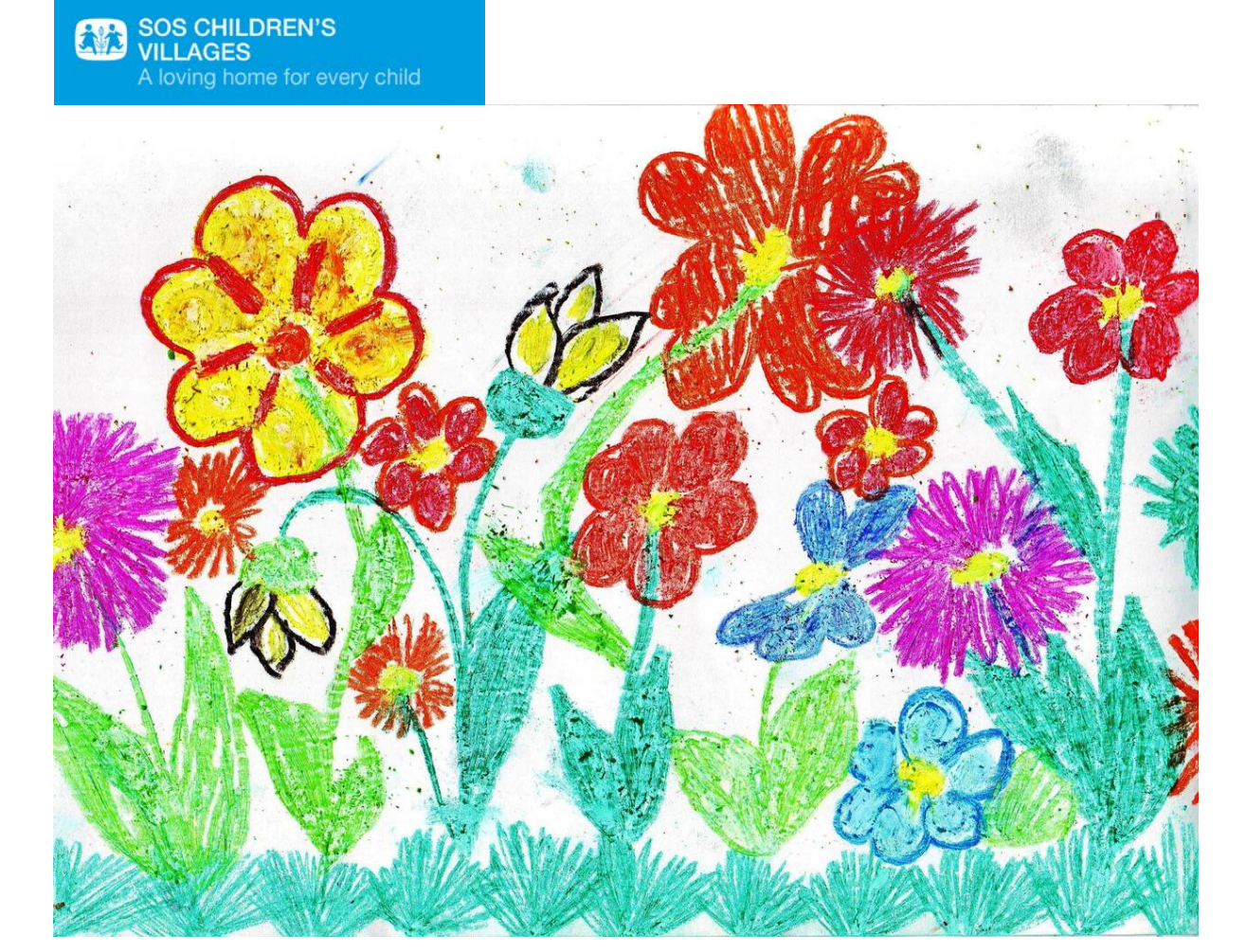
Name of artist unknown, a girl's drawing of flowers, Croatia.