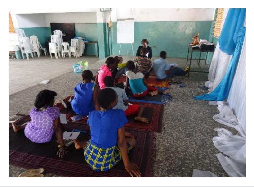
Figure 1 Group work with children.

Interviews with children and young people were conducted as group activities, except in the case of an individual interview with an adult care leaver. A standard set of questions was used, varied according to age and time available. Although the questions were asked by the medium of group discussions, in each session we included a confidential activity in which children/young people were invited to write on coloured 'post-it' sheets things they were happy about (yellow post-its) and things they were sad or unhappy about (pink post-its).