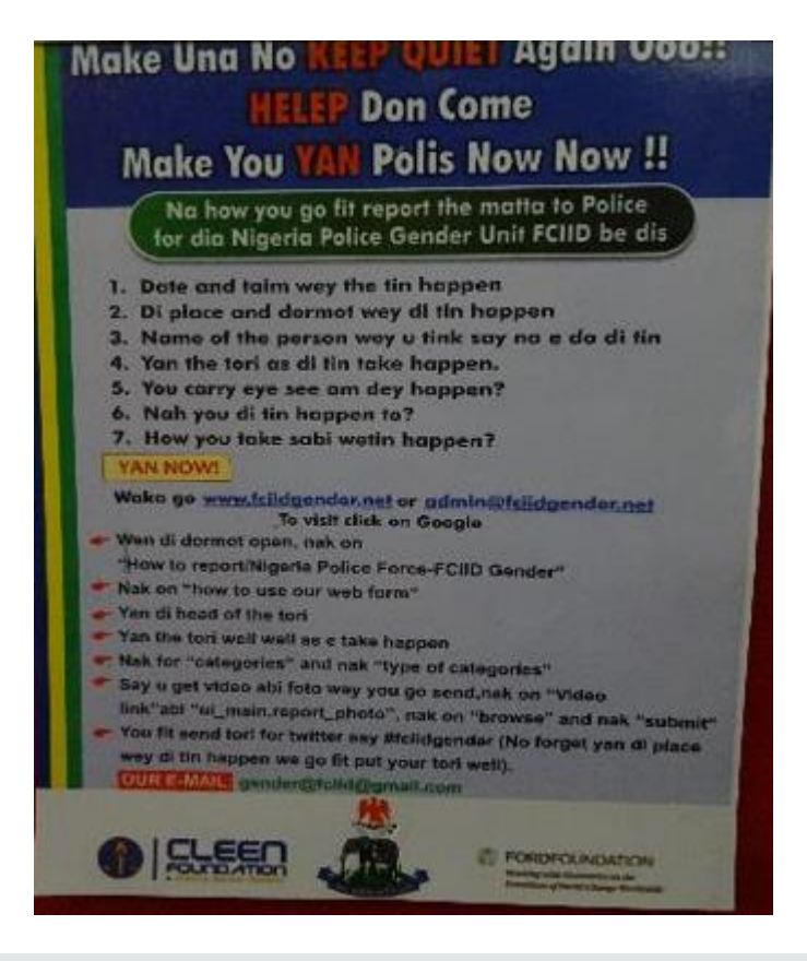
Figure 2 Notice in Pidgin. 2

The Republic of Nigeria is Africa's largest economy, its most populous country, and its largest oil producer. It is an ethnically, linguistically, culturally and economically diverse nation. Nigeria has at least 250 ethnic groups. These include Hausa and Fulani (originating in the north), Yoruba (from the south-west), Igbo (from the south-east), Ijaw, Kanuri, Ibibio, Tiv and many more. English is the language of government, commerce and education, and there are at least 500 indigenous languages, including those used by the major ethnic groups – Hausa, Fulani, Yoruba and Igbo.¹ Pidgin English is also widely used, even in public notices.