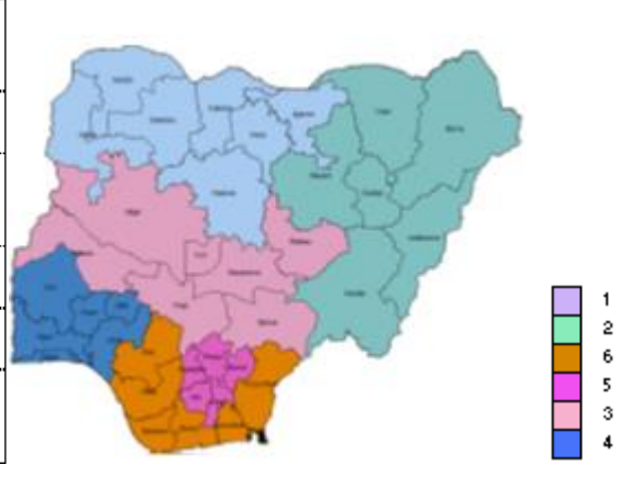
Figure 4: Nigeria - Zones and States<sup>12</sup>